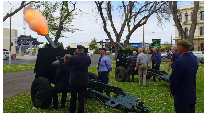
The impromptu salute at Queens Gardens.