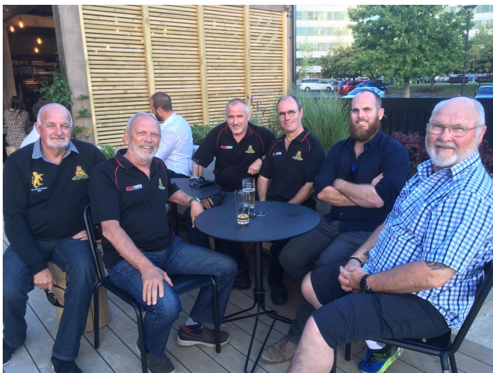
An informal St Barbara's Day gathering in Auckland.