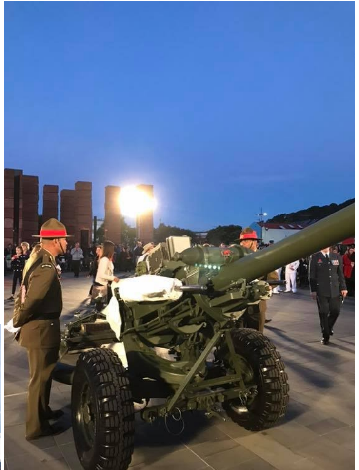
The Watch Gun in place

A sunset ceremony was held at Pukeahu National War Memorial Park to signal the end of Armistice Ceremony in Wellington.