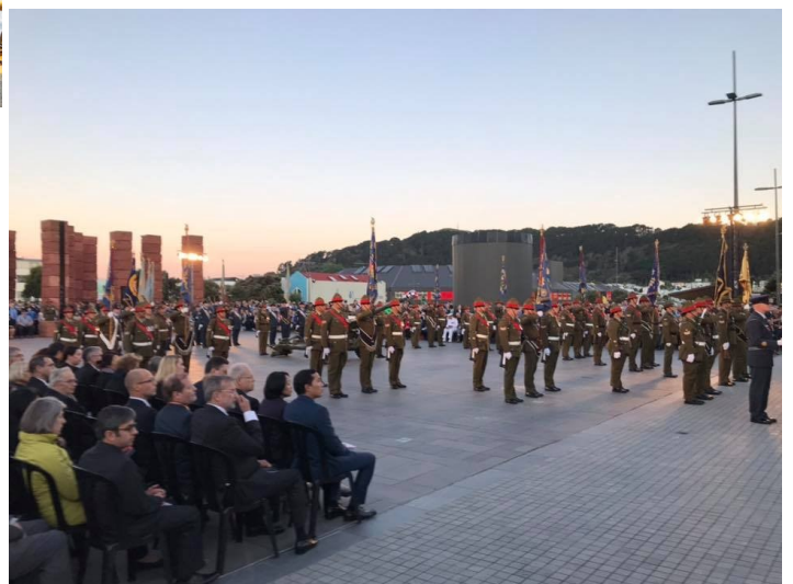
The sunset ceremony at Pukeahu National War Memorial Park