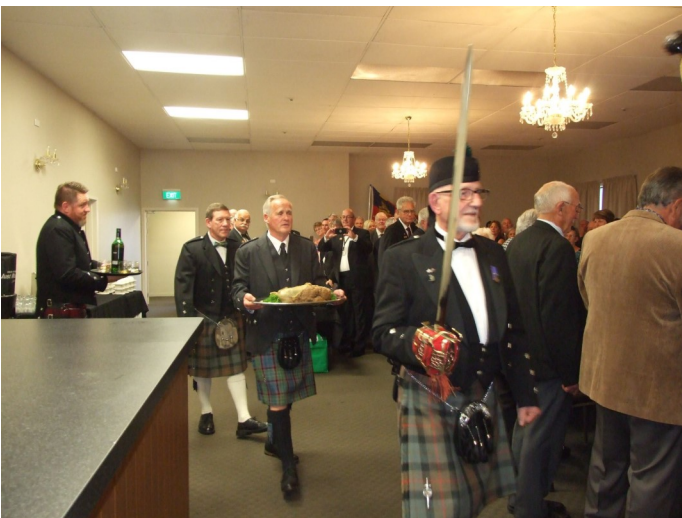
The Haggis is pied in

On Saturday night 85 sat down to dinner at the Victoria Hotel. The meal was well up to standard with other reunion dinners and there was plenty of food. The evenings entertainment was capped off with the piping in of the Haggis, which was done with due ceremony with an explanation provided for those of us that do not speak Gaelic.