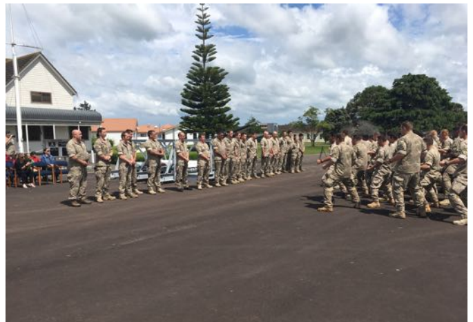
Eighteen members of the Regiment receive a farewell haka at the parade on 3 December 2019.